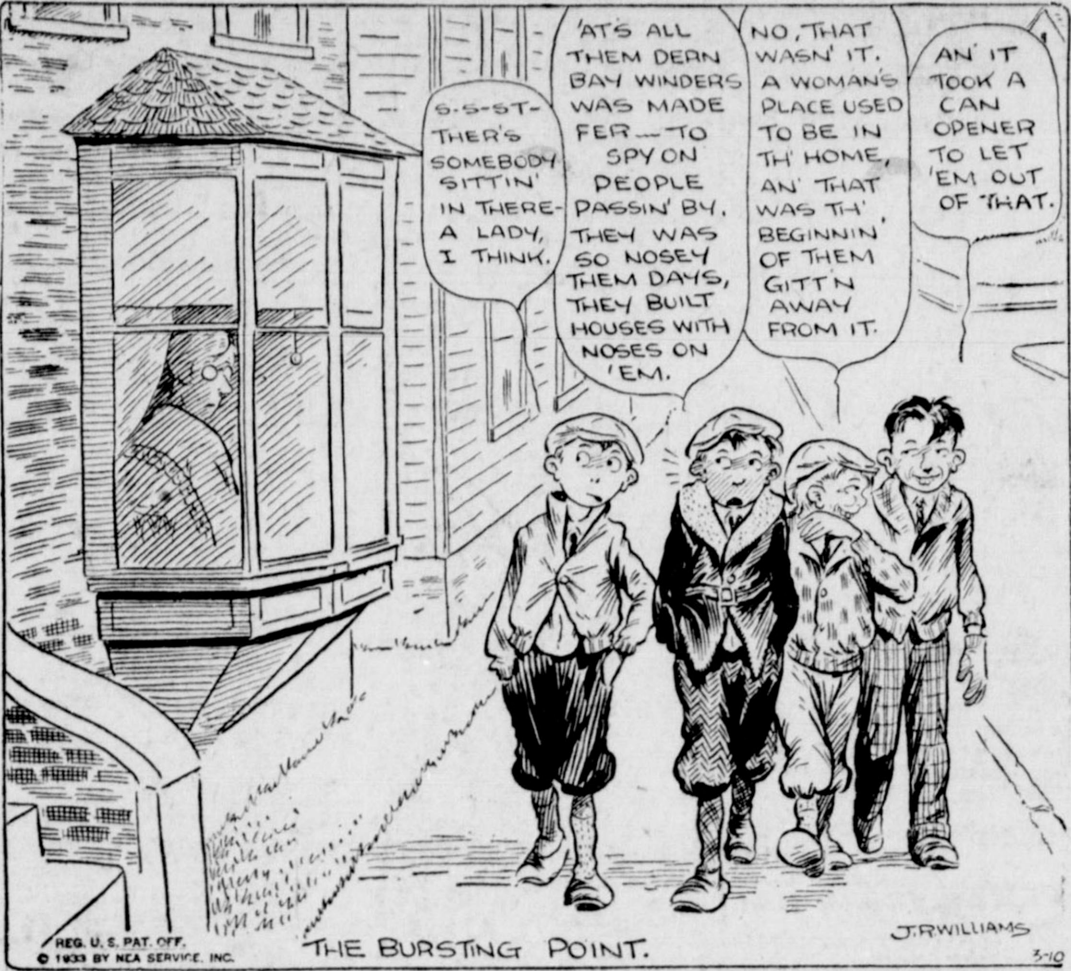
THE BURSTING POINT.