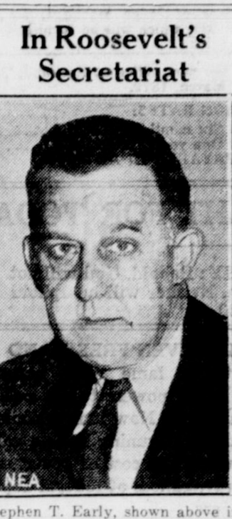
Stephen T. Early, shown above in a new portrait, has been named as one of the White House secretaries by President-elect Roosevelt.

WASHINGTON, March 10.—All federal reserve banks in the United States were permitted to open for business by the terms of an executive order issued in Washington late this afternoon.