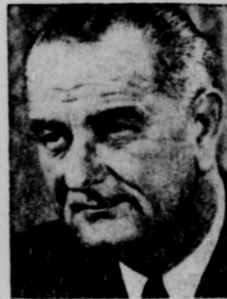
PRES. LYNDON B. JOHNSON