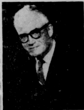
SEN. BARRY GOLDWATER