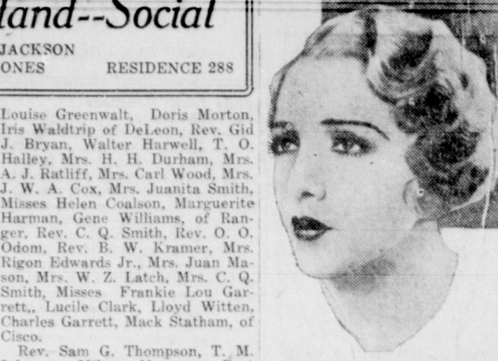
BEBE DANIELS, seen in the leading feminine role opposite Edward G. Robinson in "Silver Dollar," showing today at the Arcadia, Ranger.