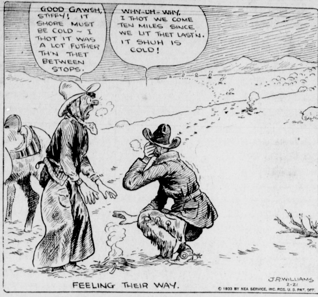
FEELING THEIR WAY.