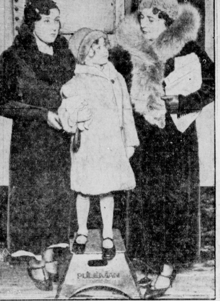
Speeding to Miami to be near Mayor Anton Cermak, two of his daughters and a granddaughter are shown here as they left Chicago. They left immediately after learning the mayor had been seriously wounded by a bullet fired at President-elect Roosevelt.