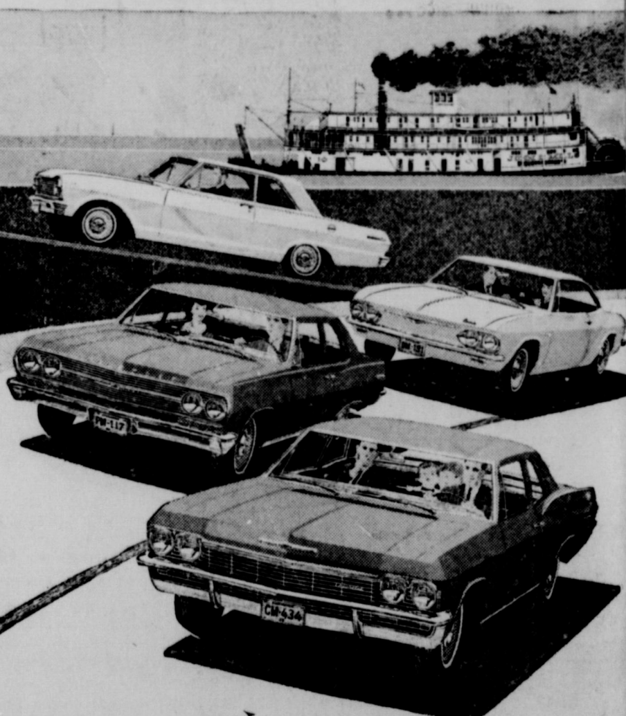
Top to bottom: Chevy II 100, Corvair 500, Chevelle 300, Chevrolet Biscayne. All 2-door models.

'65 CHEVROLET These great performers are the lowest priced models at our One-Stop Shopping Center!