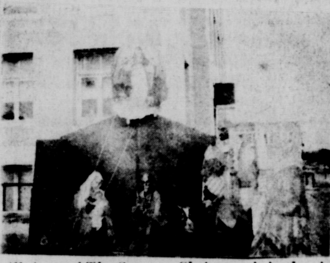
All Around The Square—Christmas is in the air