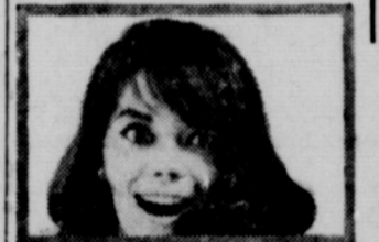
She plays the girl who became the leader of the sex revolution in America...

AN INTERSTATE THEATRE MAJESTIC SUN. — MON. — TUES. Sun. Open 1:45 — Shows 2:00 - 4:25 - 6:50 - 9:15 Mon.-Tues. Open 5:45 Show 6:30 & 9:00 Only RATED AS ADULT... No Children's Tickets Sold