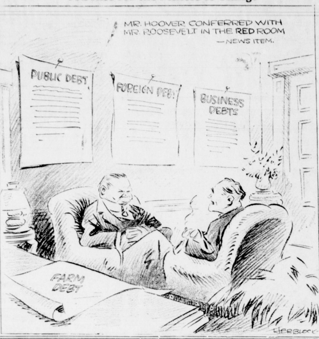
MR. HOOVER CONFERRED WITH MR. ROOSEVELT IN THE RED ROOM —NEWS ITEM.