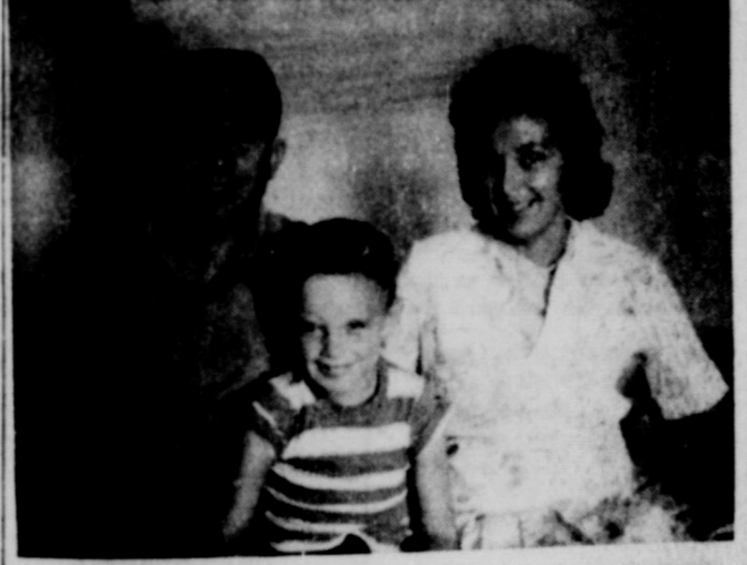
EASTLAND'S TOURIST FAMILY OF THE WEEK

Last year Eastland won five (over Cross Plains, DeLeon, Gorman, Comanche and Rising Star) and lost five (to Albany, Baird, Cisco, Ranger and Clyde.)