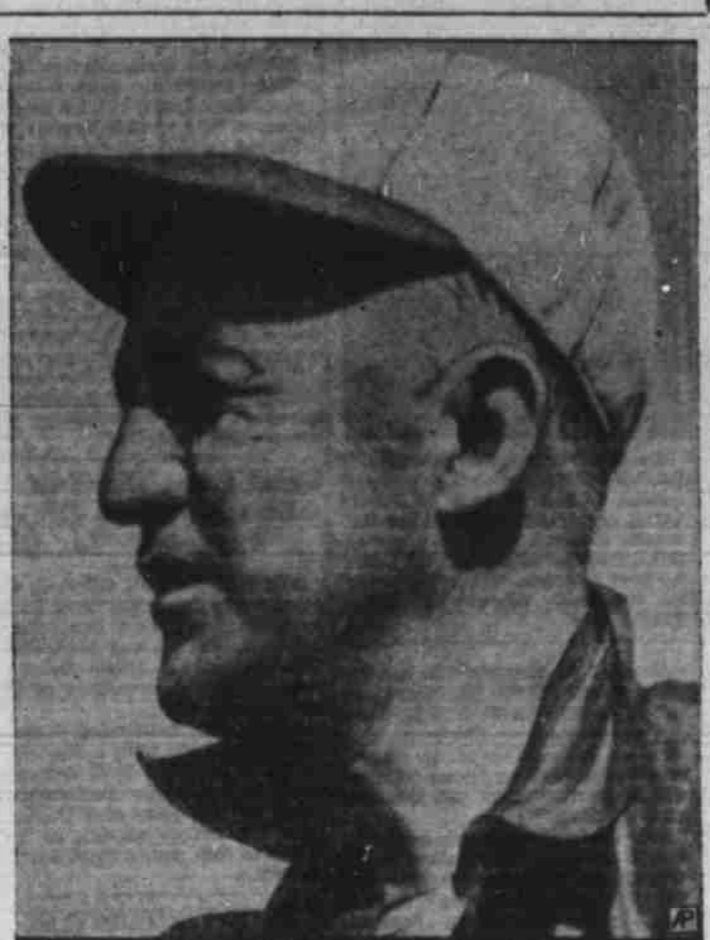
Frank Frisch, Mgr. St. Louis Cardinals