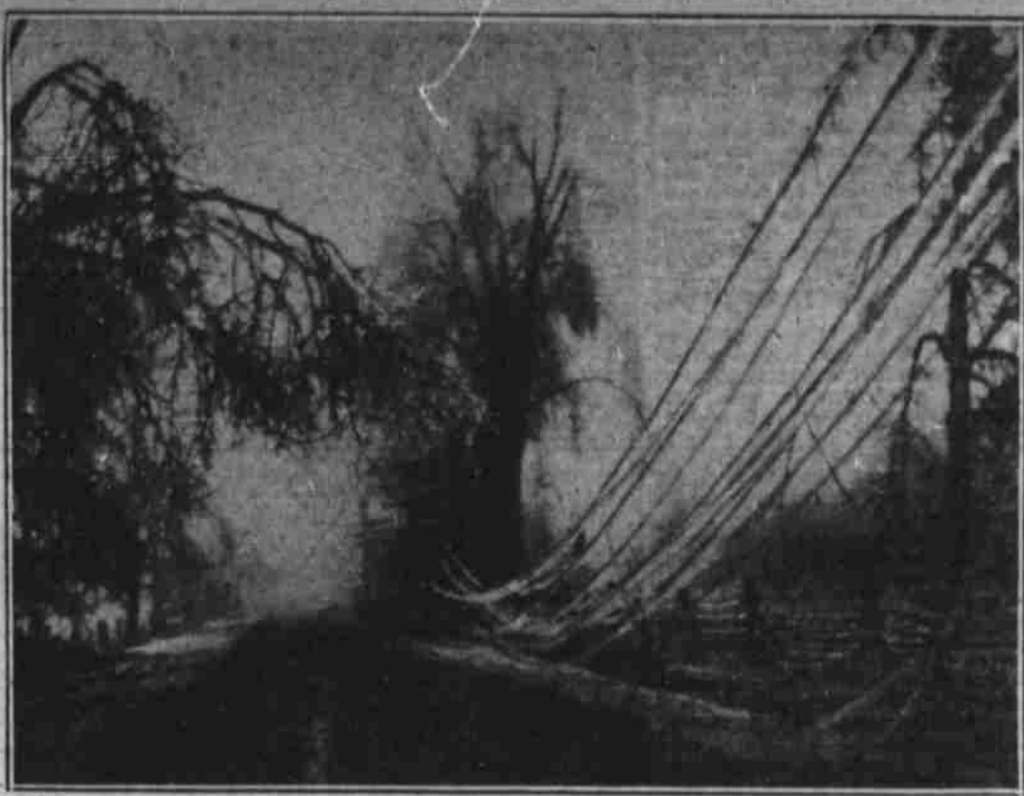
Already threatened with devastation by rising flood waters, the lower central part of New York state was given an added hazard in the form of a sleet storm. Here is a scene on the Ithaca-Binghamton highway at Ithaca, after heavy sleet and snow had snapped telephone and power lines.