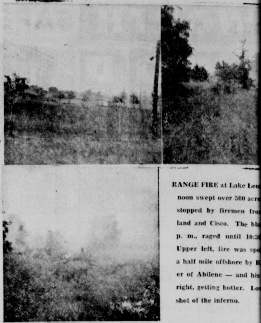
RANGE FIRE at Lake Lee