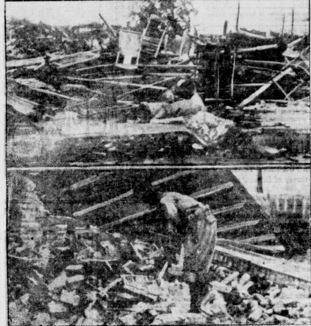
Like matches spilled from a box lay there Cuban homes (above) in Camajuani, after the hurricane had passed which took a toll estimated at 1000 lives...