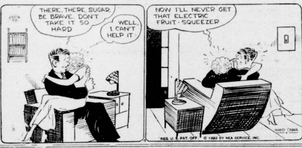
REG. U. S. PAT. OFF. © 1932 BY NEA SERVICE, INC.