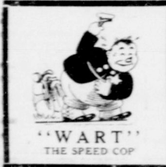
'WART' THE SPEED COP