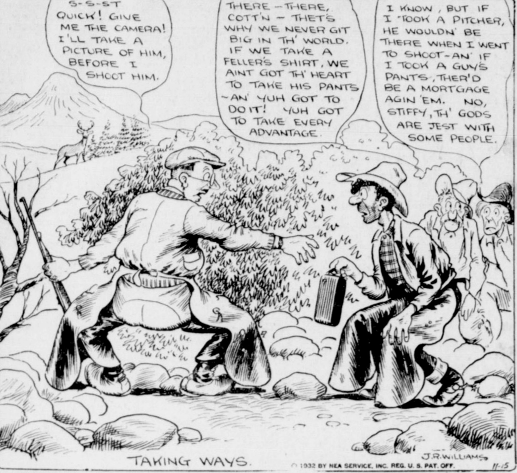
TAKING WAYS. © 1932 BY NEA SERVICE, INC. REG. U. S. PAT. OFF.