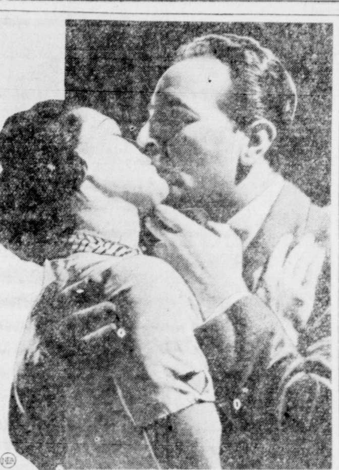
Tom kissed her quickly. "Good sport," he applauded.

Linda stood up and shook off her thoughts with a visible motion of her slim shoulders. "What's the program this morning?" "Golf for them as wants it—the boat—anything you say. Best get a dip in before lunch. Tide's high then."