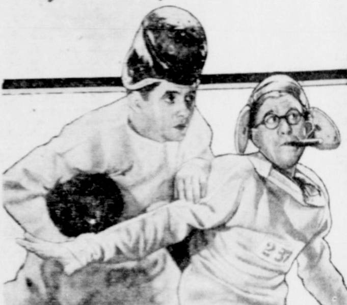
Bert Wheeler and Robert Woolsey as the prison football heroes in "Hold 'Em Jail," RKO-Radio comedy at the Lyric, Eastland.