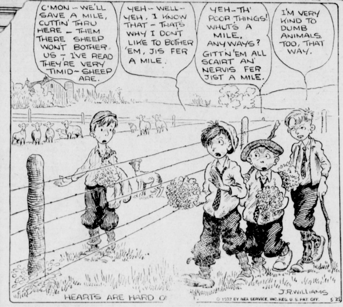
HEARTS ARE HARD O