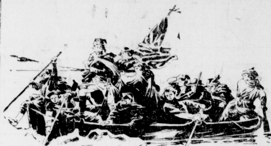
Washington crossing the Delaware