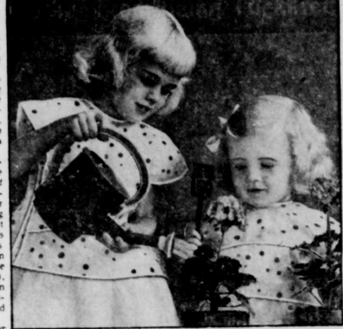
Plastic bibs for little gardeners keep the water off the "sprouts and on the plants-where it belongs. Bibs are so treated that they stay soft to the touch.

These bibs top the entire upper part of a dress, leaving only a small portion of the skirt un-