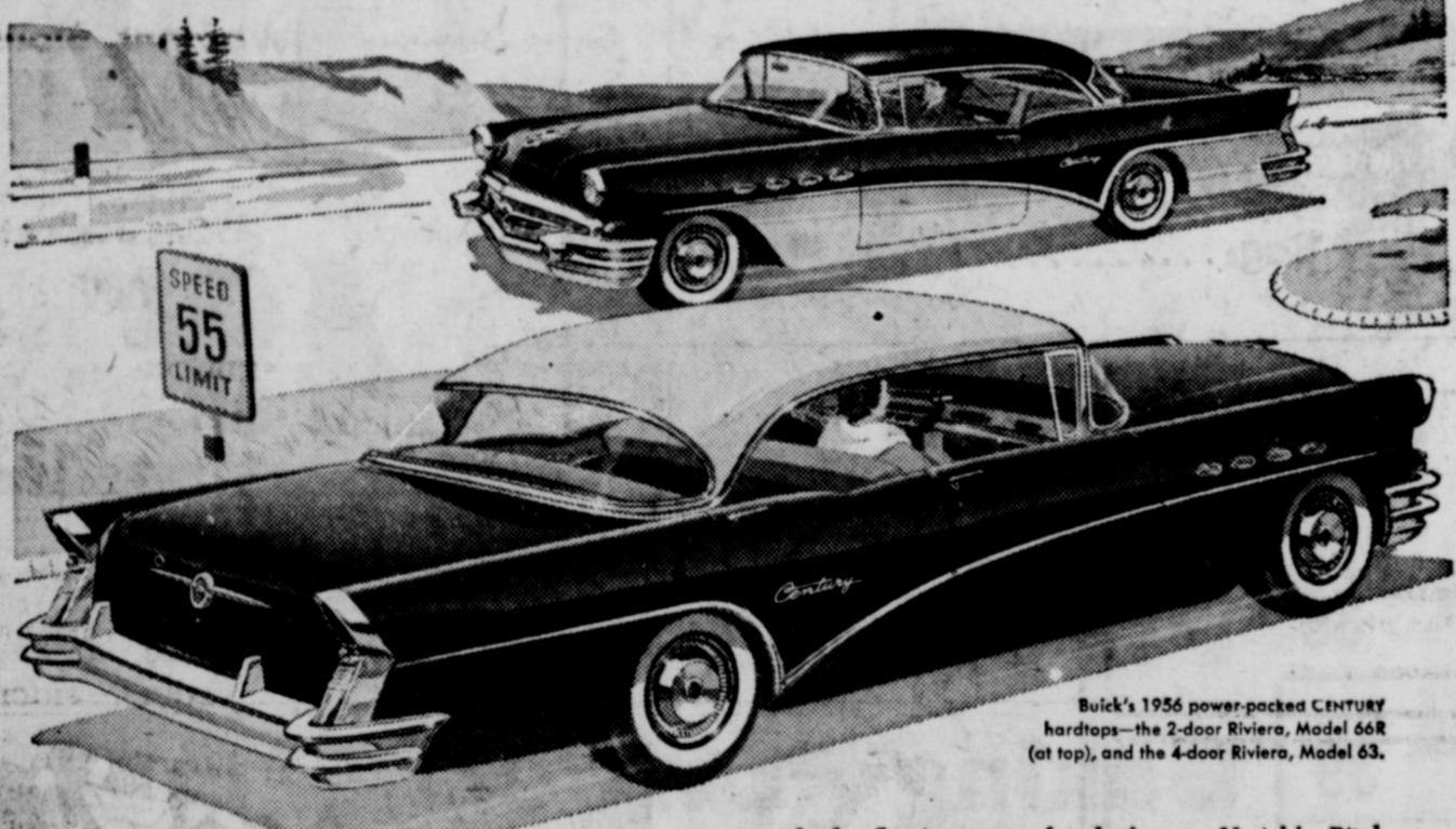
Buick's 1956 power-packed CENTURY hardtops—the 2-door Riviera, Model 66R (at top), and the 4-door Riviera, Model 63.

At 50- it's using less than 10% of its power