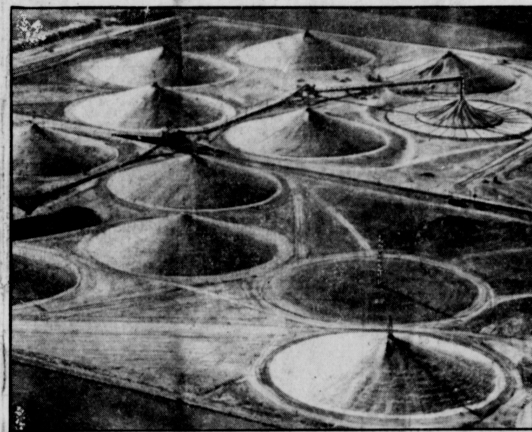
OUT OF THIS WORLD—That's the astronomical surplus storage problem which these huge, cone-shaped tents are designed to help alleviate. Each holding nearly a million bushels of wheat, they're being erected near St. Joseph, Mo., turning the landscape into something resembling an artist's conception of a space colony on a distant planet. Stages in erection are shown, counter-clockwise, beginning with second installation from lower right-hand corner. 1—Steel mast is located at center of what will become a storage tent. 2—Tent, partially filled from top by means of conveyor system, begins to rise. 3—Tent, almost full, will soon be sealed.