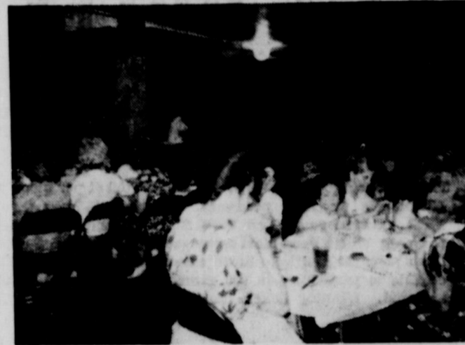
GIRLSTOWN CITIZENS ... Eating Fried Chicken

Page Four EASTLAND TELEGRAM Sunday, August 2, 1964