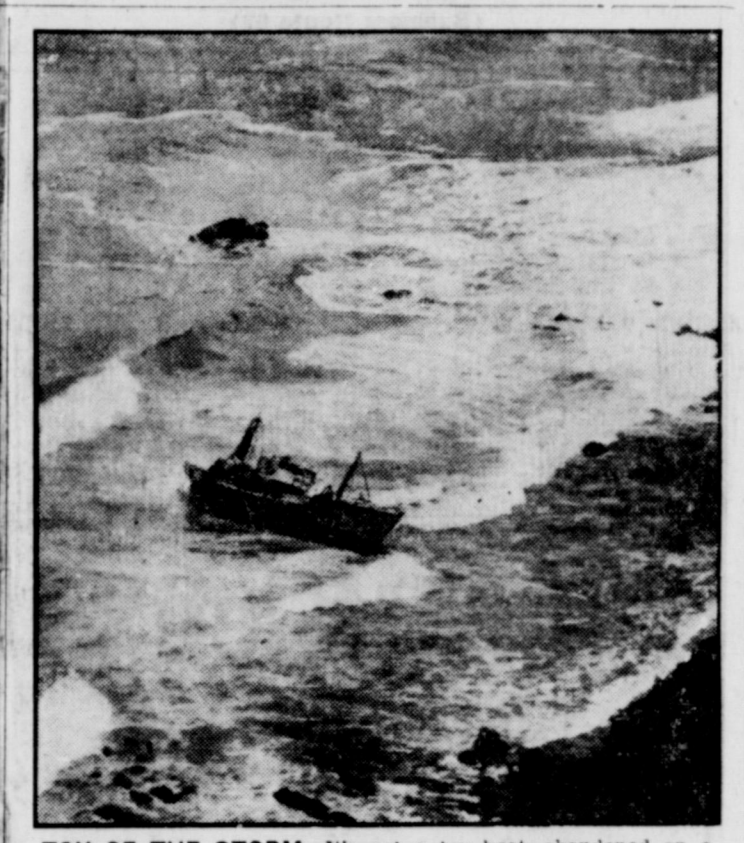
TOY OF THE STORM-It's not a toy boat, abandoned on a Belgian trawler Beatrix Fernande, battered by thunderous waves onto rocks off the Banffshire Coast. Scotland. Of five crewmen who tried to swim ashore, three drowned. Three men who stayed aboard were rescued by breeches buoy.

Inspection Service there. This total more than doubles farmers by the Southwestern Pea-