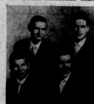
THE KING'S FOUR