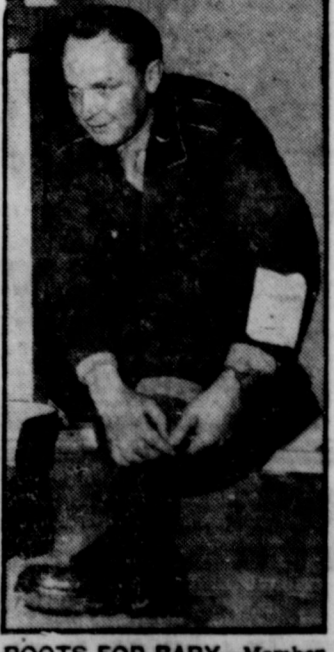
935, then Ranger with 3,200,310, then Cisco with 2,297,987, then Carbon with 82,297,987, then Carbon with 887,430, and East-Southwest. BOOTS FOR BABY—Member of the training cadre of the new West German army tries on the new uniform and combat boot which will be issued to all recruits. He's stationed at Anderwale training content which alling on Sundays this year. The above totals compare with mately 150,000,000 pounds and of and mighty fine," and congratuthe next meeting of Rotary 24,030,464 marketed in Comanthis total Caddo County alone lated the citizenry in general for dernach, training center which will be activated in January.