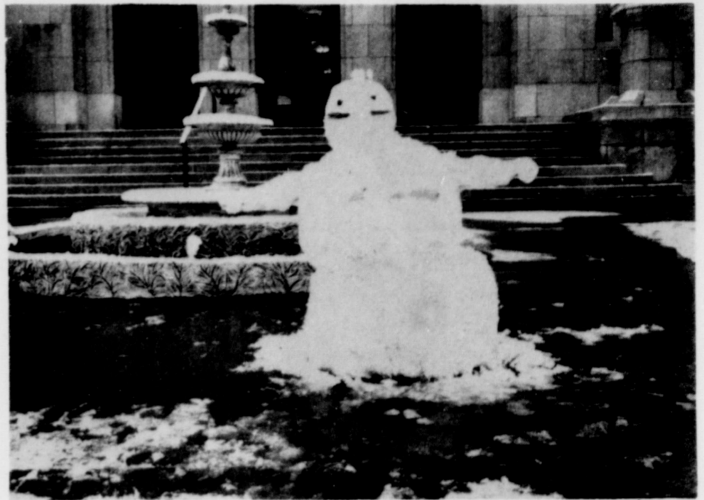
This giant snowman greeted County Employees as they came to work Tuesday morning after a 3 to 4 inch snow fall. The builders were unidentified at press time.