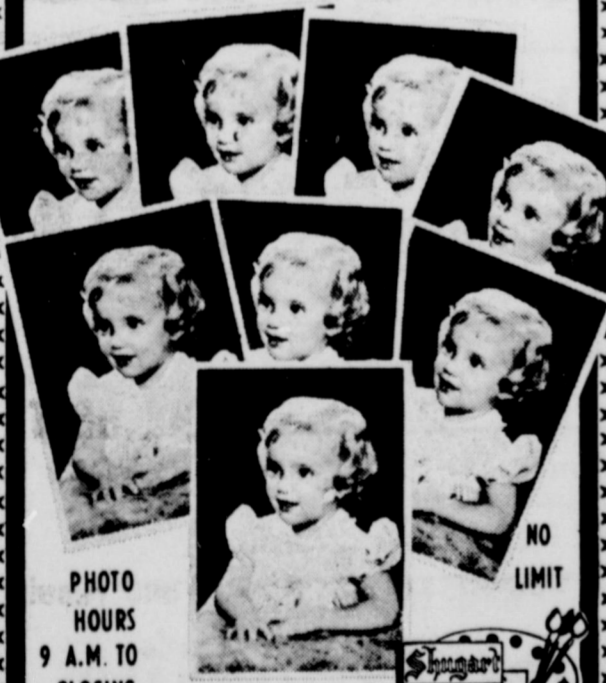
PHOTO HOURS 9 A.M. TO CLOSING

8 99¢ KING SIZE WALLET CREATIVE COLOR PORTRAITS FOR ONLY