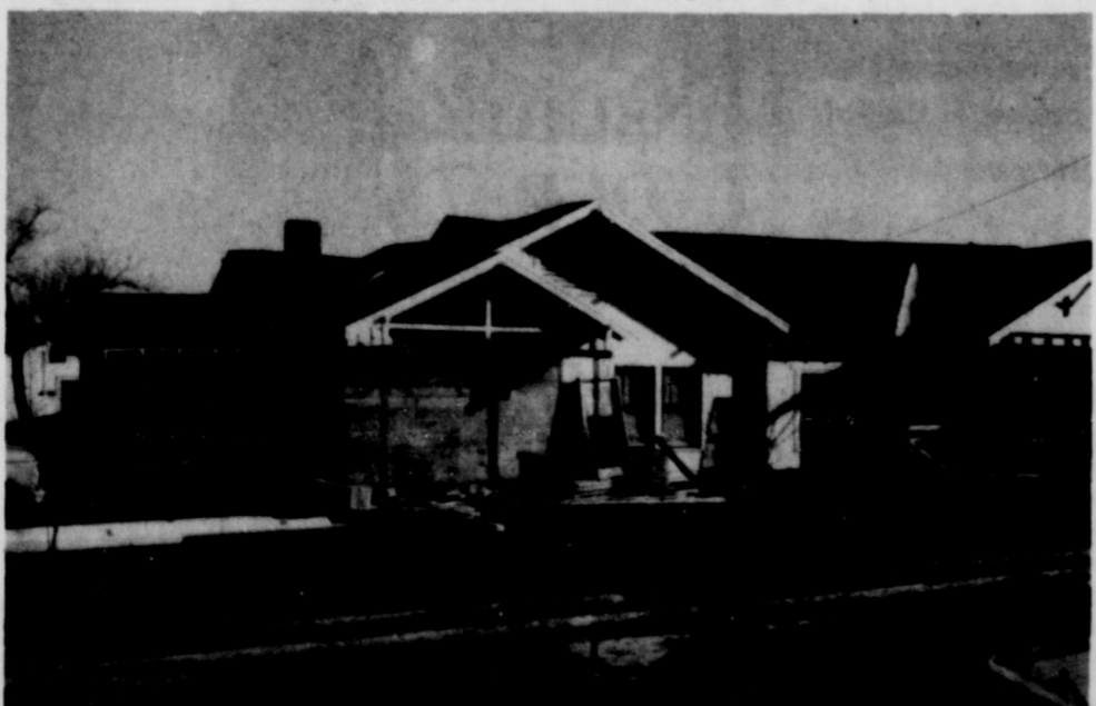
Bakker Funeral Home Soon To Be Completed