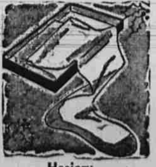
Hosiery 69c to 93c