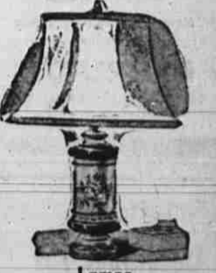
Lamps 11.90 to 15.90