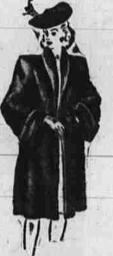
Fur Coats 69.50 to 225.00