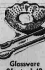
Glassware 25c to 1.49