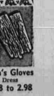
Men's Gloves 1.98 to 2.98