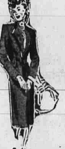
Suits 9.90 to 34.75