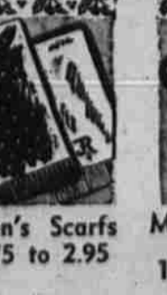
Men's Scarfs 1.75 to 2.95