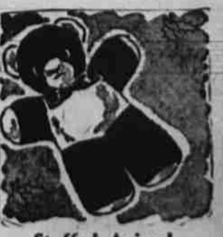
Stuffed Animal Toys 1.98 to 5.95