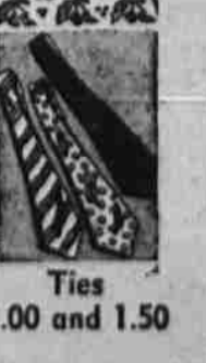
Ties 1.00 and 1.50