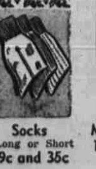
Socks Long or Short 29c and 35c