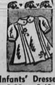
Infants' Dresses 1.98 to 2.49