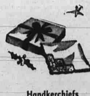
Handkerchiefs 15c to 59c