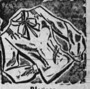
Blouses 98c to 3.95