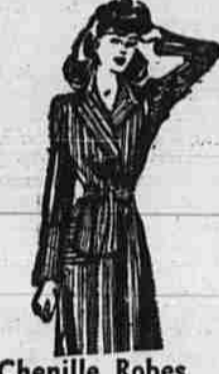
Chenille Robes 5.95 to 9.80