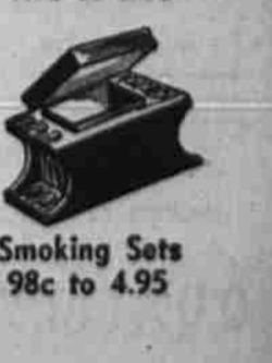
Smoking Sets 98c to 4.95