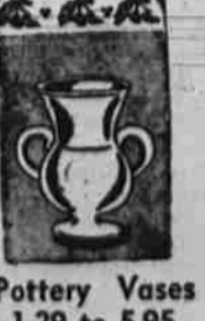
Pottery Vases 1.29 to 5.95