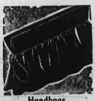
Handbags 2.98 to 8.95