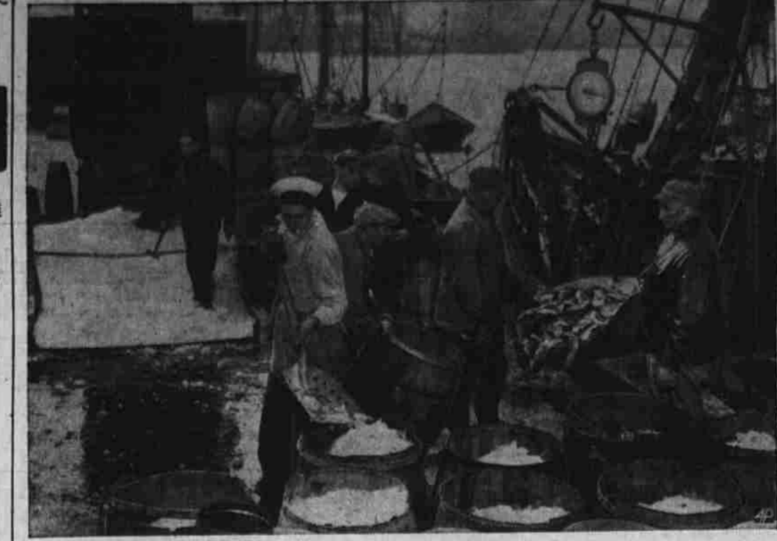
FISH FOR WARTIME DIETS — Spurred by government efforts to put more fish onto American tables to replace rationed meat, sea food shipments from both seacoasts and the Gulf of Mexico are booming.

pedo attack, Burke's ships opened fire with their forward batteries. The Japs' fire was inaccurate because of their rapid flight.