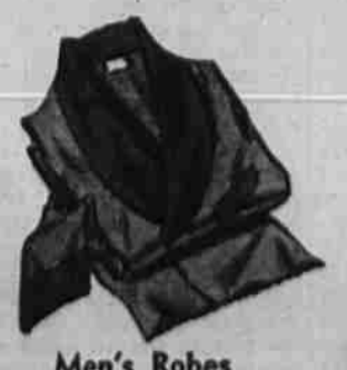
Men's Robes 5.95 and 8.95