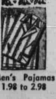
Men's Pajamas 1.98 to 2.98