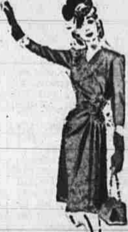
Dresses 3.95 to 14.90