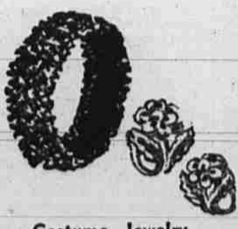
Costume Jewelry 50c to 14.90