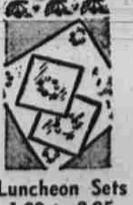
Luncheon Sets 1.98 to 8.95