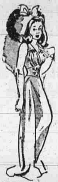
Night Gowns 2.98 and 3.95