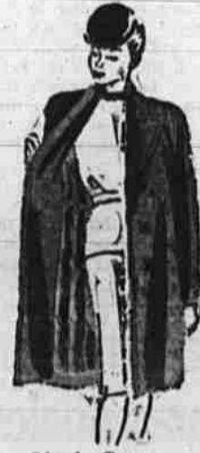
Cloth Coats 14.90 to 65.00