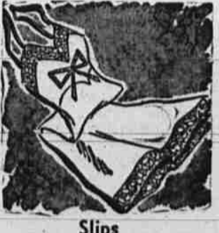
Slips 1.69 to 2.69