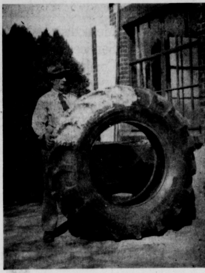
Our repair shop is very busy nowadays. We can fix up about any size tire—from tires on your car to the biggest tractor tire. Do you old-timers remember the man in the picture?

When you lay $100.00 or more on the line for a set of new automobile tires, you hope to get two or three years of safe and trouble-free driving pleasure.