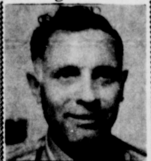
By Clint Bray

Nerve: that which enables a man seated on a bus to flirt with a woman who's standing.