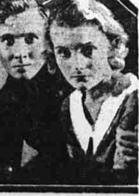
Walter Huston, Helen Chandler and Kent Douglass appear at the Ritz Thursday only in "A House Divided."