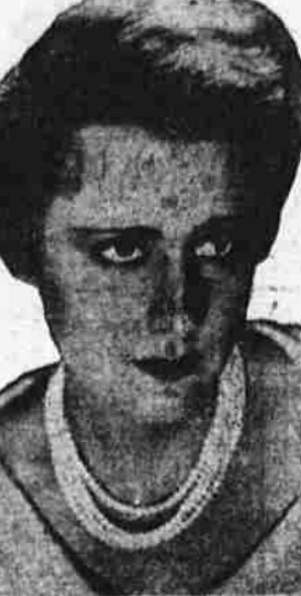
IRENE DUNNE, above, who is destined always to be remembered by millions because of her outstanding portrayal of "Sabra," in "Cimarron," will appear at the Ritz Tuesday and Wednesday in "Consolation Marriage."