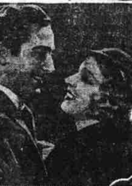
Ina Claire and David Manners are shown above in a scene from "The Greeks Had A Word For Them," which will be the feature picture at the Ritz Theater Friday and Saturday.