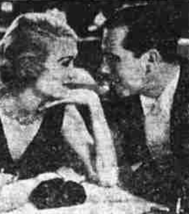
Constance Bennett and Ben Lyon in Romantic Moment in "Lady With A Past," current at the Ritz.