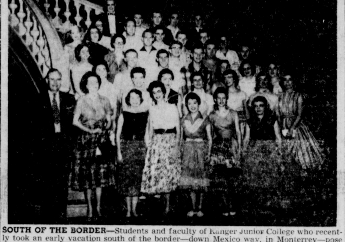
ly took an early vacation south of the border—down Mexico way, in Monterrey—pose final decision as to the use of the for a Mexican photographer during their stay at one of the city's hotels. (See story money is left to the hospital's government of the city's hotels.

That's about it for now. See you in church Sunday and back here again Tuesday.