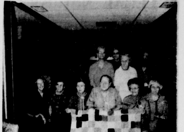
Pictured above are the ladies of Valley View Lodge who completed the lap robe shown. The lap robe is double knit, completely lined and tacked. This being the first venture in hand crafts, the ladies are very proud of their completed project. We would like to take this opportunity to thank everyone who was kind enough to donate quilt scraps.

I hope other mothers will let their feelings be known concerning this matter. a Concerned Mother