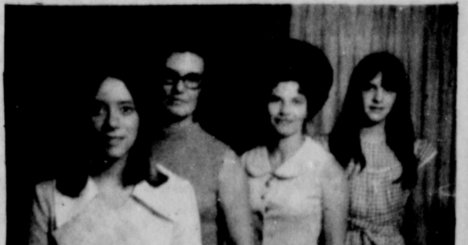
Thirty local models paraded the halls showing more than 50 garments to the residents in the privacy of their rooms and the living rooms. Quetta's and Mode - O 'Day furnished the new fall fashions ranging from shorty pajama's to fur coats.