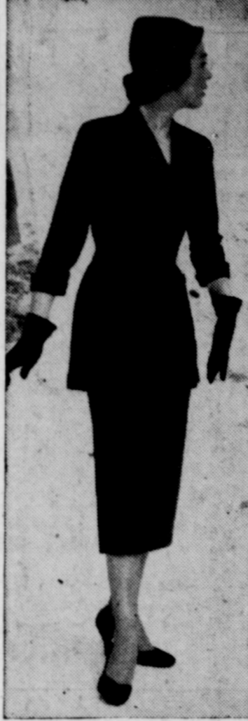
A three-quarter Prince Albert jacket makes the top of this two-piece suit in a blend of acetate and silk. The long lapels of the shawl collar are accented by colored braid. Novelty buttons fasten the jacket to the hipline. A slender walking skirt completes the tunic silhouette. Colors are sno-copper, sno-green, and sno-purple. A Jeanne d'Arlet by Kohen-Ligon-Folz. Sizes 10-18. About $20.00.

Schreiner Institute, beaten by Victoria, 48-0 last week, faces another Longhorn Conference power in Del Mar at Post Lavaco on Saturday. Del Mar breezed by Henderson County JC, 21-7 last week.