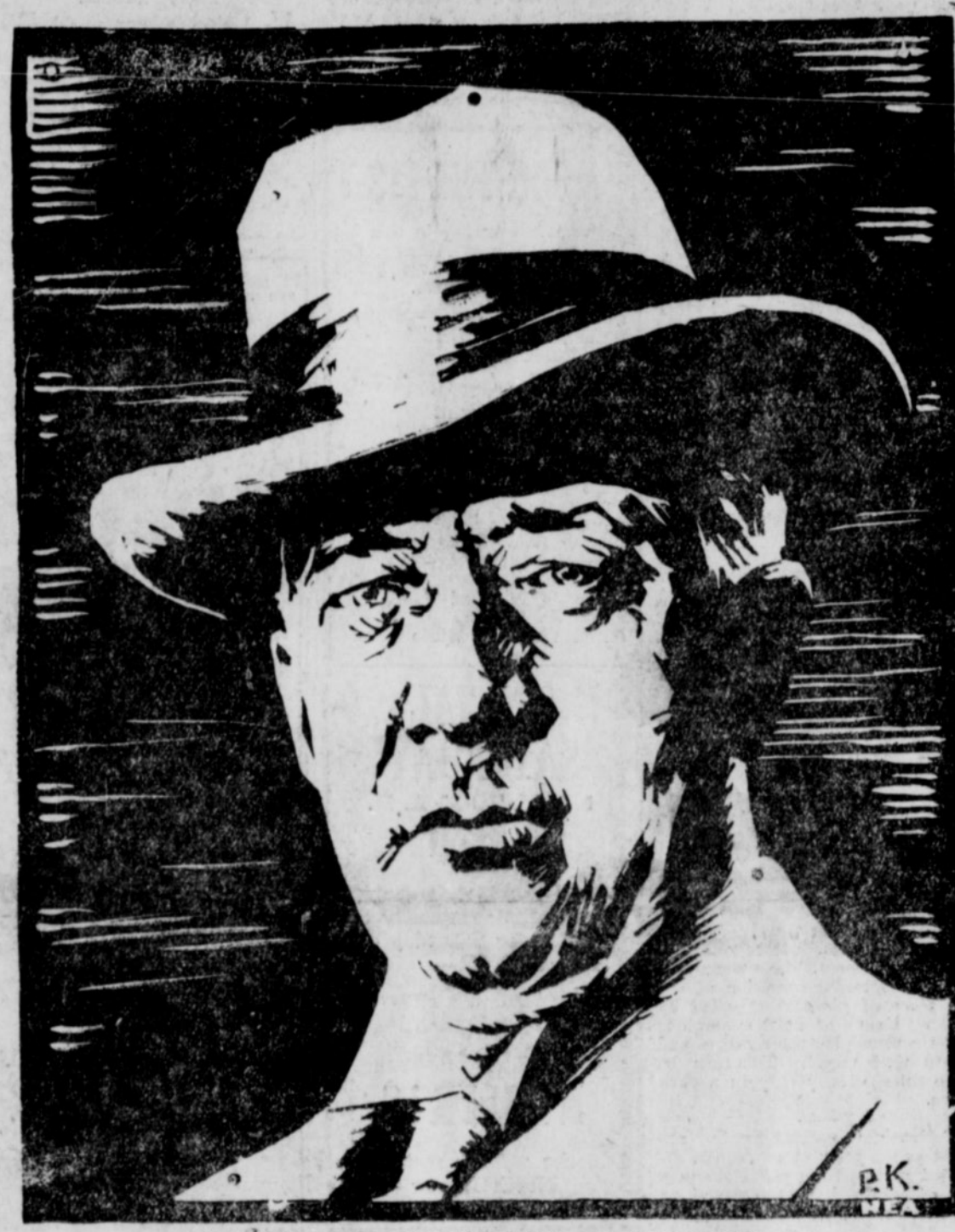
GOVERNOR ALFRED E. SMITH OF NEW

NOMINATED BY DEMOCRATS AS THEIR CANDIDATE FOR THE PRESIDENCY OF THE UNITED STATES