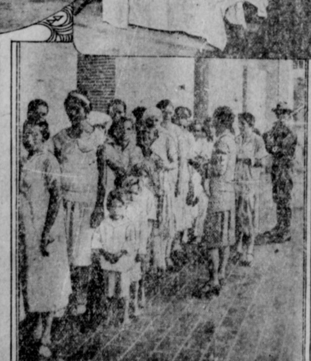
in line at Red Cross relief headquarters waiting for food. Above-Red Cross Emergency Hospital at San Juan.

Ranger, Unique Illustrating Company vs. Oilbelt Motor Company, on appeal from Justice Court, Precinct No. 2, Ranger.