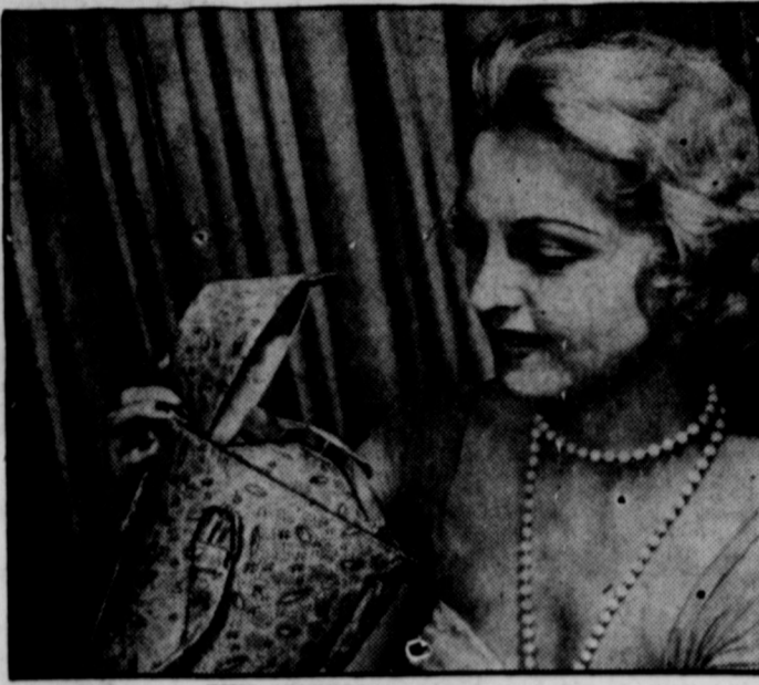
MAKING-UP'S A BREEZE—It is, if you have a handbag such as this one, recently shown in Offenbach, Germany. A tiny dry battery concealed in the brocade-covered feedbag-type leather accessory powers a compact-size fan concealed under the lid.