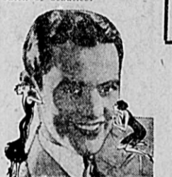
Charles (Buddy) Rodgers in "Safety In Numbers"