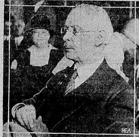
This photograph shows Bishop James Cannon, Jr., as he appeared on the witness stand in Washington when he accused in Senate questions of "persecution" and refused to answer their questions about his southern anti-Smith campaign of 1928.