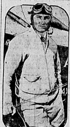
Paul Warner, the hard-hitting ball hawk in the outfield of the Pittsburgh Pirates, also is something of a hawk in the sky, judging from this picture. Warner is an enthusiastic aviator and spends considerable of his time among the Oklahoma clouds when at his home in Ada, Okla., in the off season.

NANCY CARROLL The Devil's Holiday With Phillip Holmes and Harry Gribben A HOLLYWOOD Paramount Sound