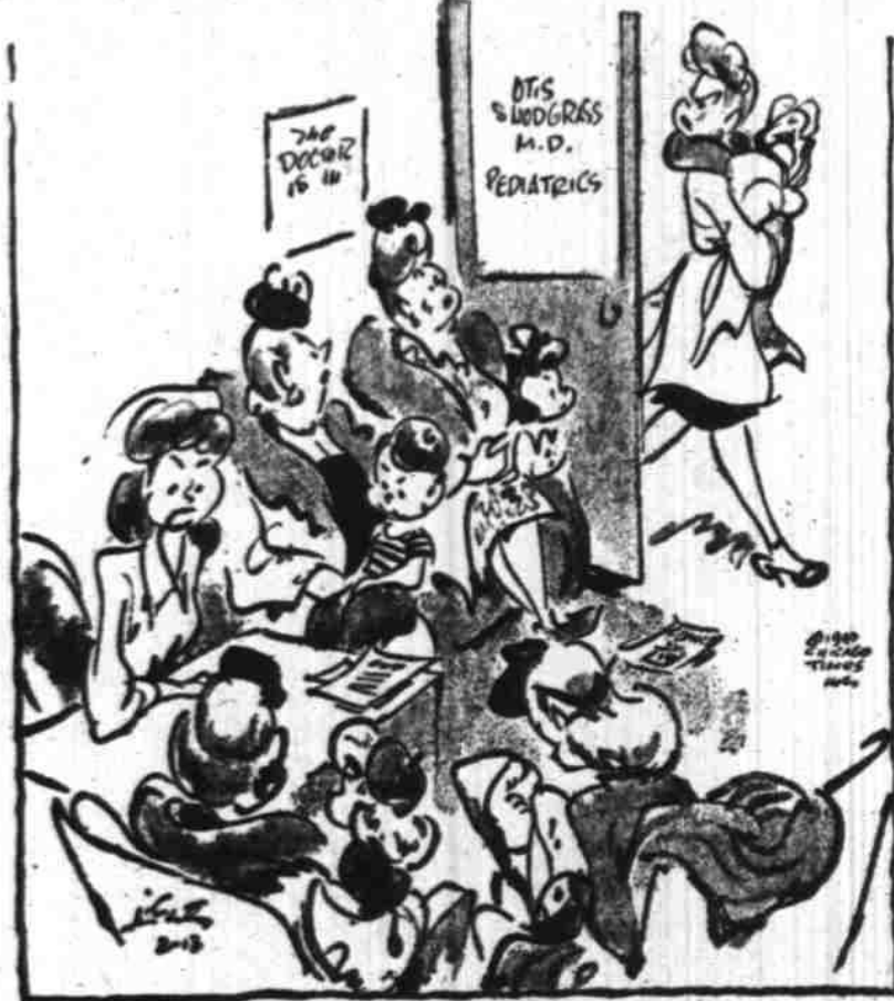
"The doctor's overworked—he's cutting down his practice by telling a new mother that her child is just normal for its age!"