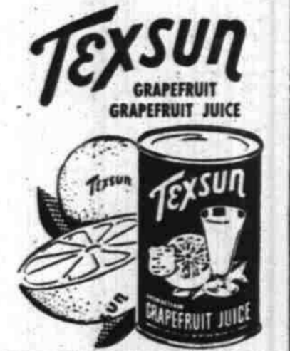
TEXSUN CITRUS EXCHANGE • WESLACO, TEXAS

Throughout the nation folks may argue about politics or the weather. But there's no disagreement when the taste of ALL turns to naturally-succer