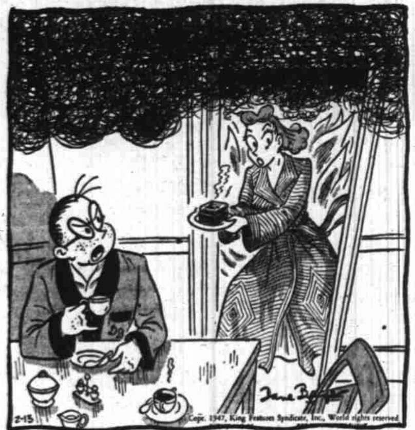
"Honey, DON'T tell me you've burnt the toast again!"

During World War II the number of people employed by Class I US railroads rose from about 1,000,000 to about 1,420,000.