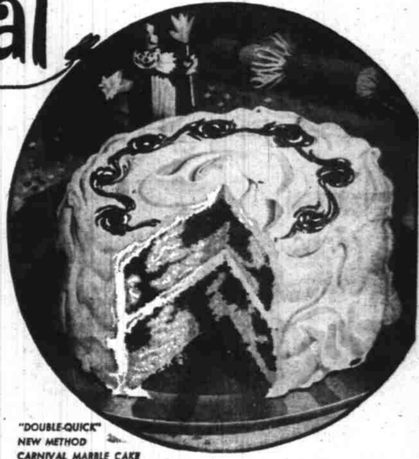
"DOUBLE-QUICK" NEW METHOD CARNIVAL MARBLE CAKE

FREE! Betty Crocker "6 Easy Dinners" recipes . . . coming soon . . . at your grocer's! A boon for busy homemakers! Be on the lookout for them!