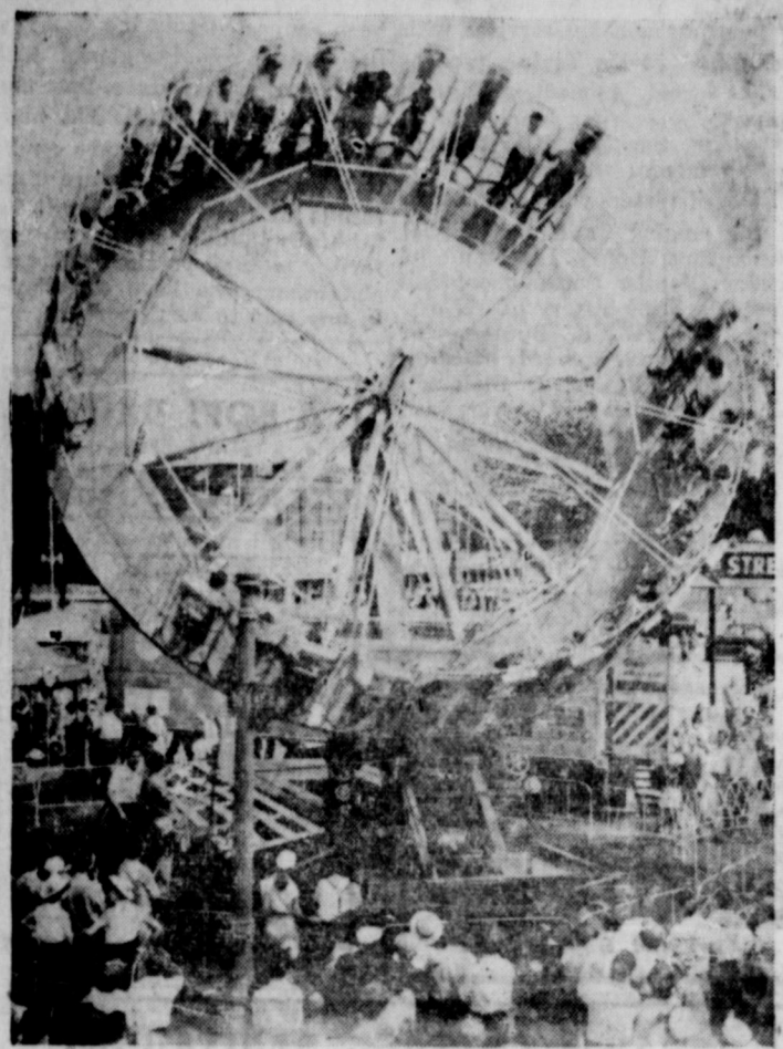
NEWEST IN THRILLS—The Roundup almost seems to defy gravity as it goes around and around and, at the same time, slants now up and now down. The latest thing in the way of exciting rides is creating thrills at big Mid-Western fairs and will be seen in this section for the first time at the Heart O' Texas Fair, Oct. 1-7, in Waco. Twenty-four other shows and rides will be presented by Twentieth Century Shows, one of the biggest Midway organizations in America.