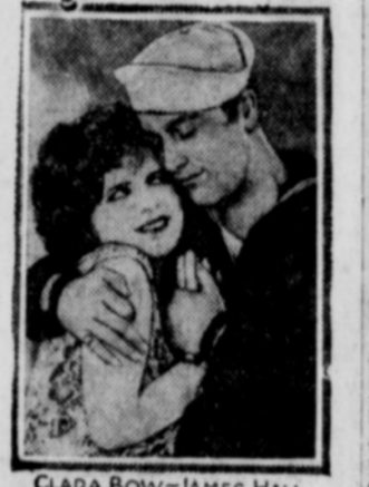
CLARA BOW—JAMES HALL IN THE PARAMOUNT PICTURE "THE FLEET'S IN"

The paying part starts here. The next duty of the bridegroom-to-be is to gather together members of his family and collect all the gifts possible to be presented to his betrothed's family. Then a "breathing spell" is permissible before the next and greater installment of gifts must come from the "boy friend's" family. The most painful part of the ceremony—the giving of all the money the young man's family can raise to the family of the bride-to-be—is reserved for the last episode before the nuptials. After this if the young Mayan lover can prove his ability to care properly for his bride he is permitted to go through with the ceremony. Otherwise he must look further.