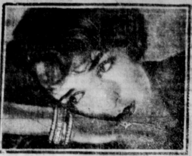
BABE DANIELS IN THE PARAMOUNT PICTURE "TAKE ME HOME"