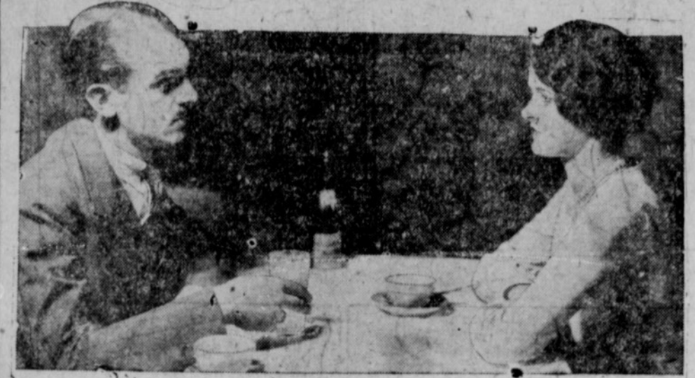
"One doesn't mind the opinion of a servant," he said, and Jerry felt squelched.

he said when she made to get up, "You've got to me, Jerry. You've ally your side of this thing pising me unfairly. And, you said something just aing, on the way out here, me to believe—" in't," Jerry Jenied. "I've iven you any right—"