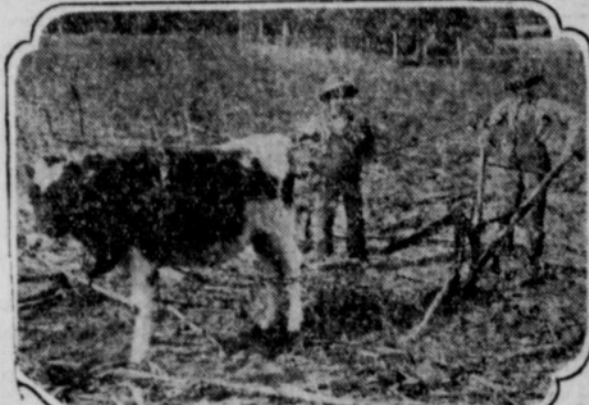
BUSHELS OF CORN AN ACRE