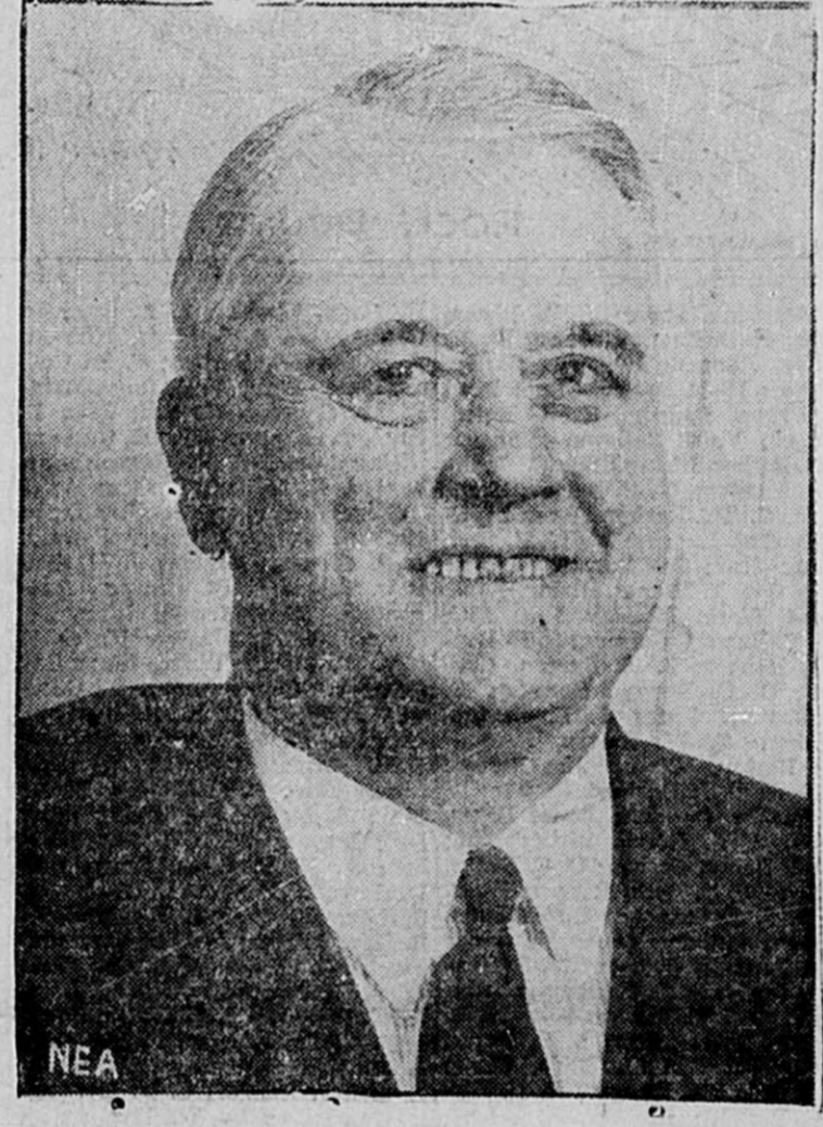
This rare posed photo of Col. Robert W. Stewart in a smiling mood shows him in New York when he arrived from Chicago to press his fight for re-election as director and chairman of the Standard Oil Company of Indiana over the opposition of the Rockefeller interests.

FLASHES By United Press. MEXICO CITY, Jan. 24—Twenty-one Army air pilots were ordered to proceed with their planes today in an active campaign against rebels in the mountains of Jalisco. Michoacan and Guanajuato. Bristol and Bohnau machines will be used.