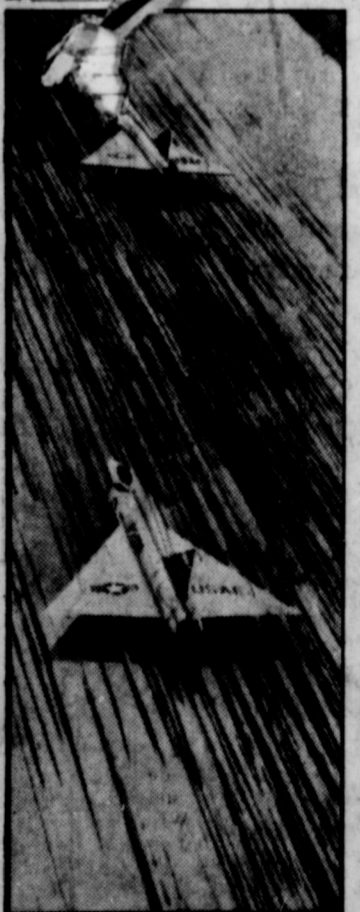
SWIFT ILLUSION — Delta-winged F-102A jets aren't streaking down this runway at Palmdale, Calif. The all-weather, day-night interceptors are parked on the runway. Streaks resembling lines of movement in a time-lapse picture are tire marks left by previous jet landings at the Mojave Desert base.

REG. $495 NOW $368 President Series, 4-Cylinder Auto Air Conditioners. Special Clearance. Installed - Guaranteed. Don Pierson Olds - Cadillac Eastland, Texas