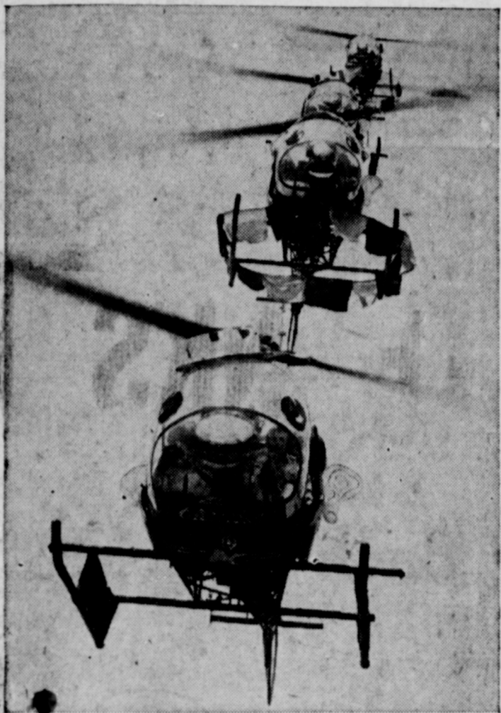
AND ALL PROMENADE—The Army's famed Helicopter Square Dance Team from the Army Aviation Center, Camp Rucker, Ala., a featured event at the National Aircraft Show in Philadelphia Sept. 3-4-5, lines up for a final bow. The four Bell H-13 "choppers" are dressed country-style and dance the same way—for fun and to show the maneuverability of this member of Army's flying family.