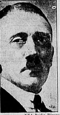
Adolph Hitler, head of the German Fascist party, is the man of the hour in Germany today as a result of the general elections, which gave his party 107 seats in the Reichstag.