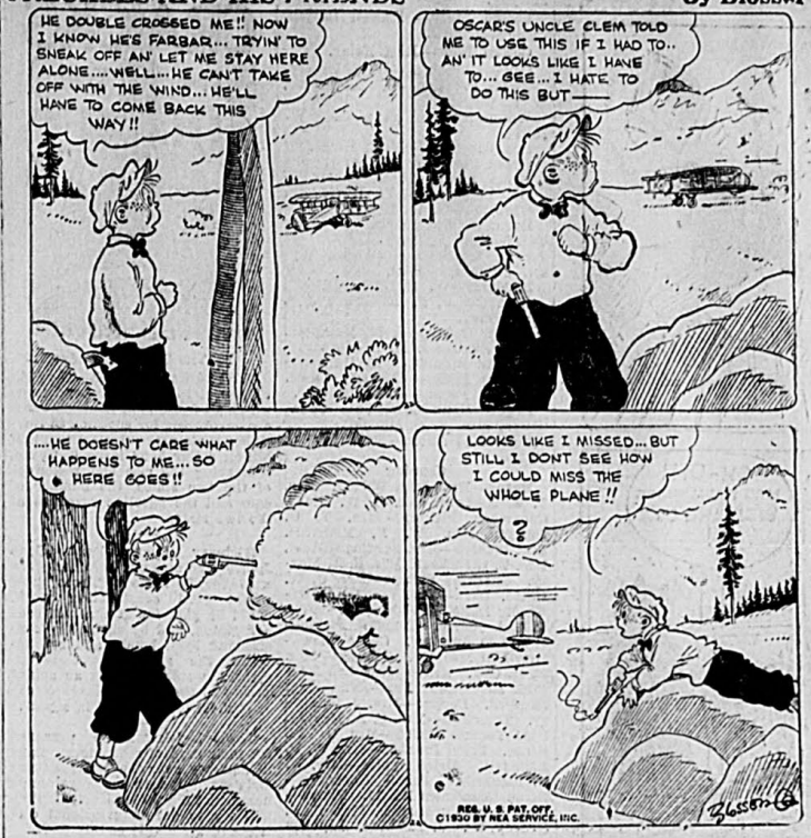
REG. U. S. PAT. OFF.