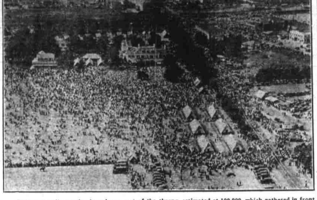
This extraordinary air view shows part of the throng, estimated at 100,000, which gathered in front of Gov. A. Harry Moore's "Little White House" at Seagriff, N. J., to hear Gov. Franklin D. Roosevelt of New York, democratic presidential candidate, deliver the second of his series of campaign speeches.