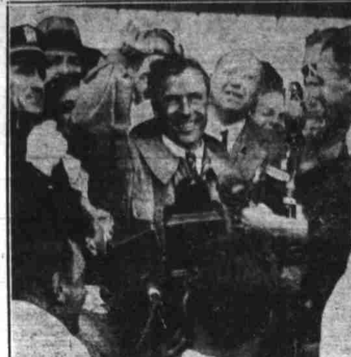
Capt. J. A. Mollison met some 2,000 enthusiastic New Yorkers with a smile and a wave when he landed at Roosevelt field after a flight from Pennfield Ridge, N. B., where he came down after crossing the ocean from Ireland.