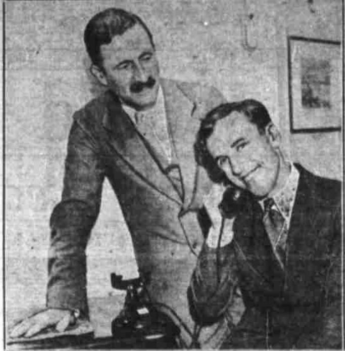
Soon after he arrived at his hotel, Captain Mollison called his bride of a few weeks in England and told her about his arrival in New York.

NOTICE TO SUBSCRIBERS: Subscribers desiring their address changed will please state in their communication both the old and new addresses.