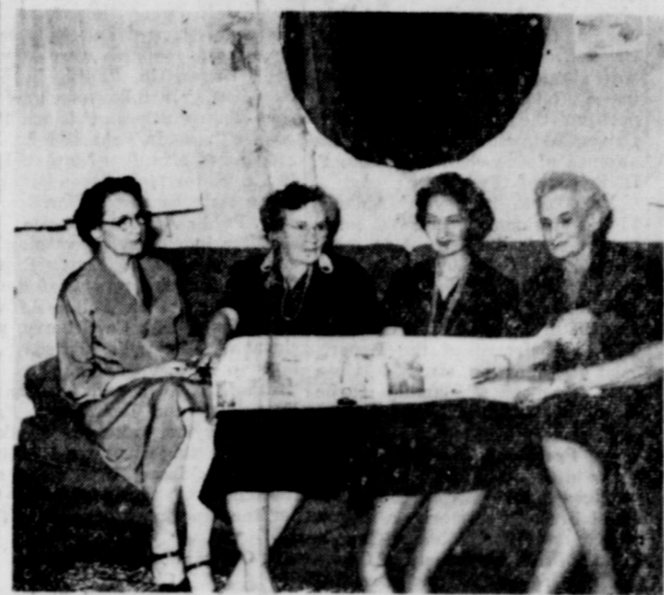
Welcomes Dist. TFWC Convention-Goers

Mostly cloudy and warm with strong southerly winds today, tonight and Wednesday. Scattered thundershowers this afternoon and tonight. High Tuesday 85-90, low Tuesday night 65-70, high Wednesday 85-90.