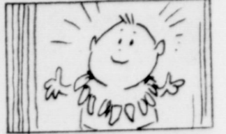
Here's a cure with a bite to it: Sea Islanders sometimes tie a necklace of alligator's teeth around a teething baby to relieve the pain!