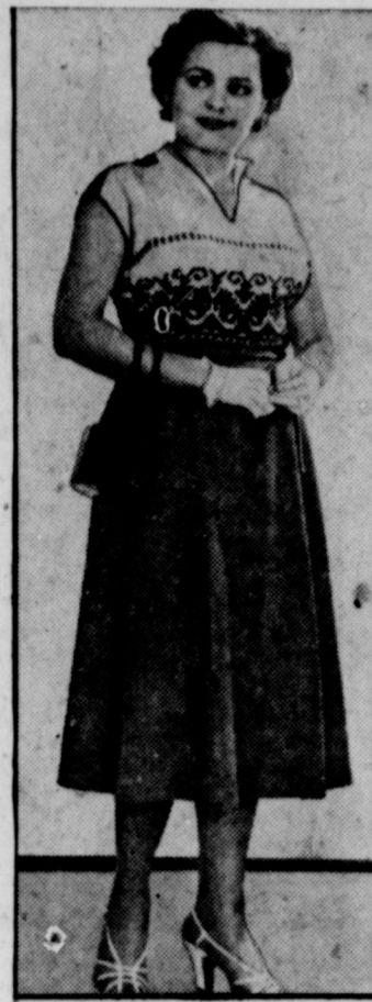
TRADITIONAL — Traditional Russian folk pattern is motif for blouse of this two-tone silk summer ensemble, one of the spring-summer fashions being modeled in Moscow, U.S.S.R.