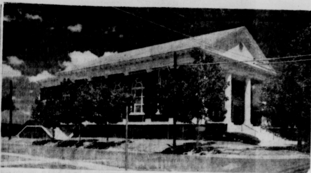
CHURCH OF CHRIST — Located on the corner of West Plummer and South Daugherty, the Church of Christ members met for the first time in this building in May of 1920.