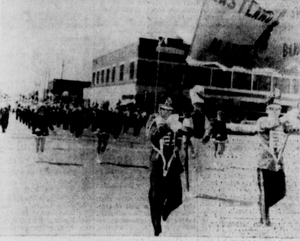
EASTLAND HIGH SCHOOL MAVERICK BAND ... in Stock Show Parade