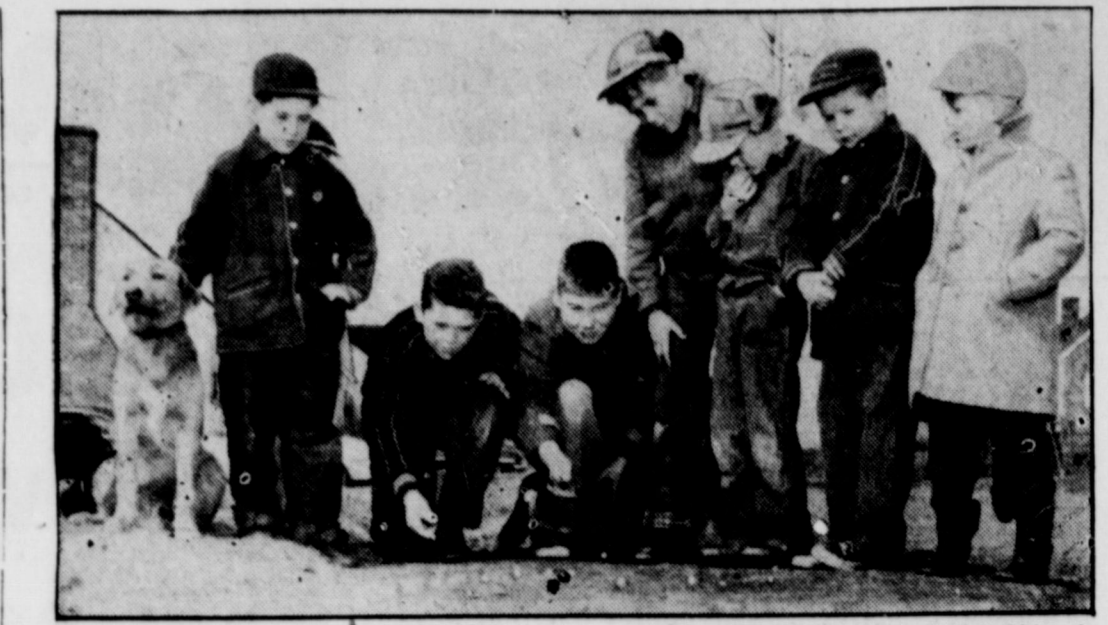
KNUCKLE UNDER TO SPRING—Winter's over, for sure, when the marbles are brought out of storage. Small boys in Beverly, Mass., give the lie to the thermometer and their heavy clothes as they start the ceremonial process which is completed only when one of the lads winds up with all the aggies and laws in the crowd.

210 • Stays 34% Stronger • Lasts 14% Longer At the Sign of the FLYING RED HORSE W. Q. VERNER Phone 64 Eastland