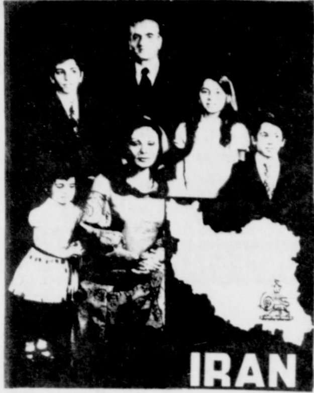
The Shah And His Family