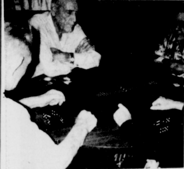
Domino players at Eastland Manor