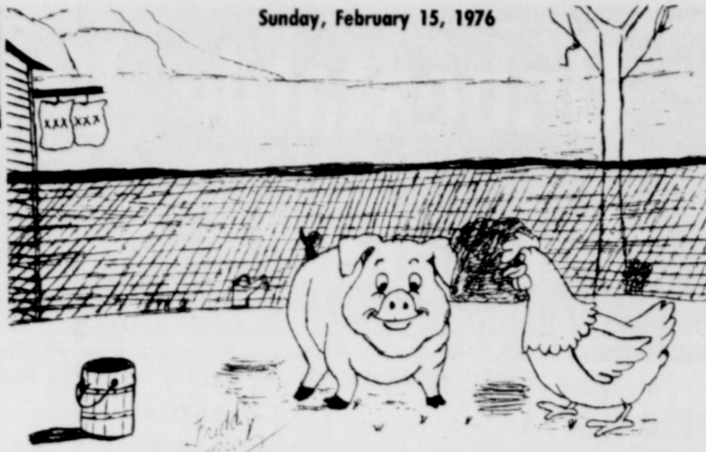
'SURE,' I'M READY FOR THE EASTLAND COUNTY LIVESTOCK SHOW, MAR. 18-19-20

Looks as though the Freedom Train will miss Eastland County.