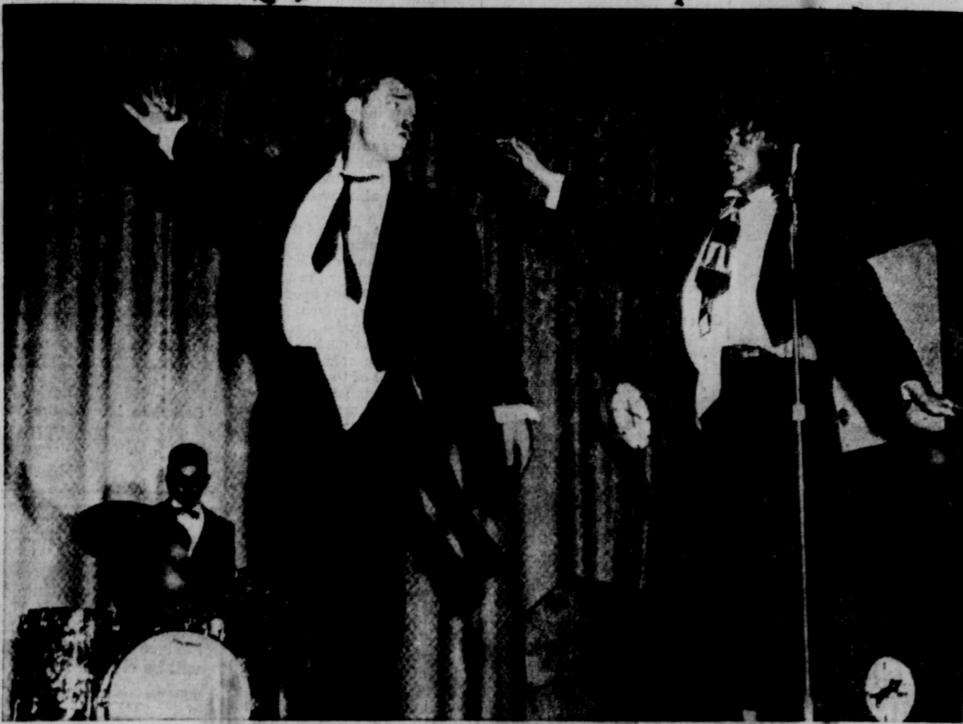
'WHOOPI' IT UP' — These two mimics put in free-style in the musical stage show "Nothing Can Go Wrong" which is due on stage in Eastland, Peanut Bowl Day, Saturday, September 14, at 4 p. m. at the Majestic Theater. Backed by a swinging combo, this is just one of the many acts from the family-style musical, comedy show. The show is one of several features of the Jaycee-sponsored Peanut Festival.

... ment Loans ... 60 months to pay ... National Bank ... TEXAS