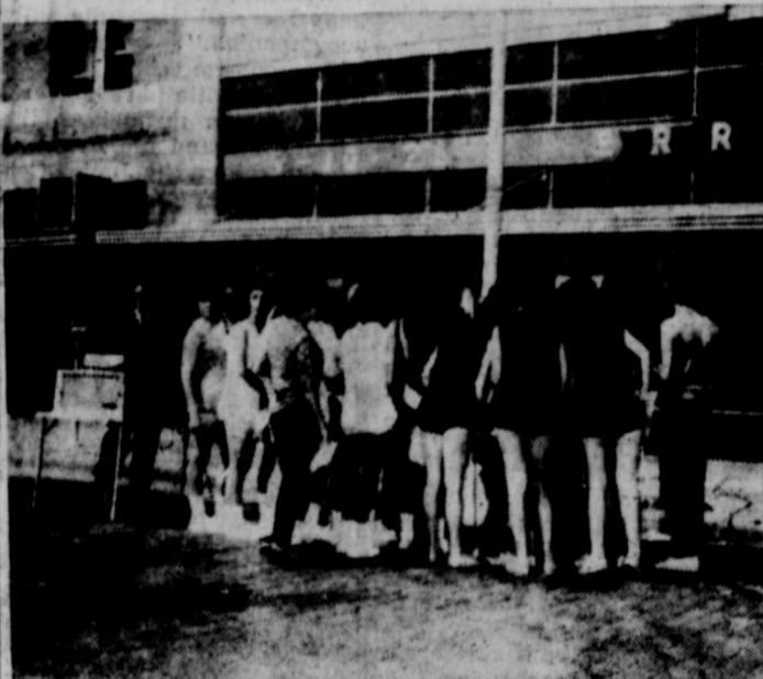
GETTING TWIRLING MEDALS