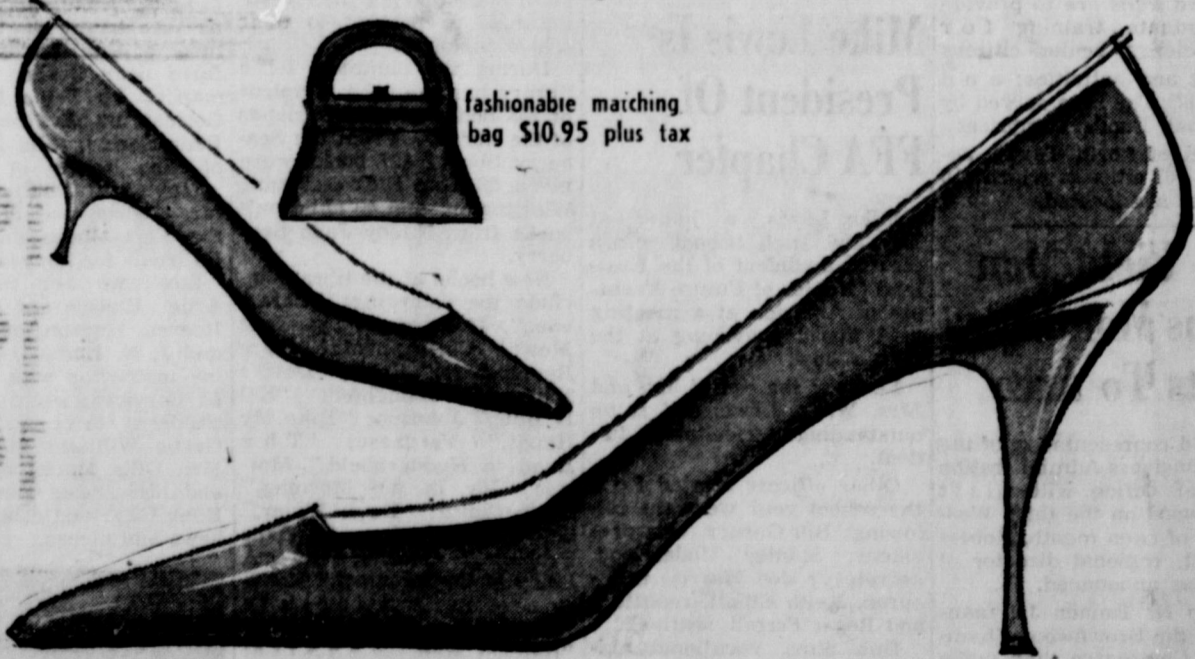
fashionable matching bag $10.95 plus tax

HAVE YOUR SOFT NEW PUMPS EIGHT GEORGEOUS WAYS! Choose your smart square-throat chipped-toe high or midheels with Antiqued Red, Antiqued Tan, Antiqued Brown or calf or red, or Black Suede or Black uppers. Just count the places you'll wear these! $10.95 to $12.95