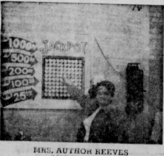
1312 No. Carroll $25.00 WINNER