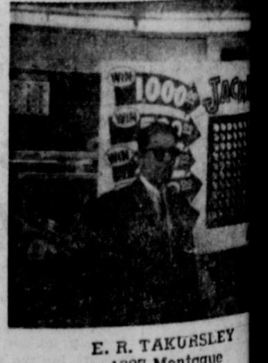
1207 Montague £25.00 WINNER